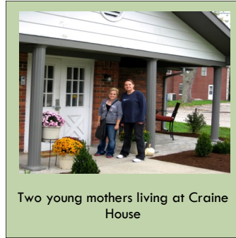
Two young mothers living at Craine House